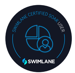
Swimlane Certified SOAR User (SCSU)

Swimlane's Certification Program is designed to help you get the most out of Swimlane's SOAR solution. The training offers multiple certification levels, including certifications for Swimlane users, administrators and developers.